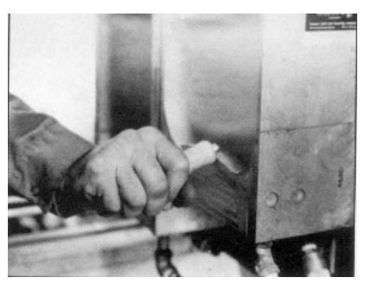
Figure 2: Apply the tool with both force and judgment to sharpen worn pinch-offs.