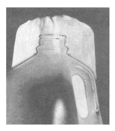
Figure 4: With the flash ending far too high on the handle, a blowout and a useless bottle result.